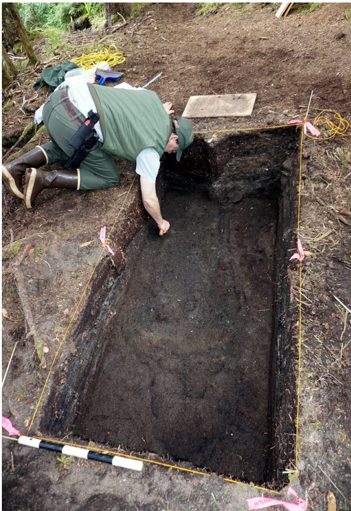
Fig. 10. The outline of a coffin burial was discovered at the northern edge of the survivor camp. Рис. 10. Фрагмент гроба погребения был обнаружен на северном краю лагеря выживших.