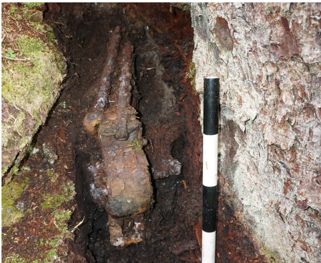
Fig. 9. A yard brace (sailing ship's hardware) discovered in the "North Cove" area in 2016.

Рис. 9. Палубная скоба (деталь парусного судна), обнаруженная в «Северной бухте».