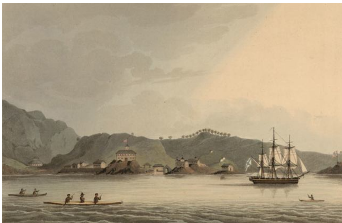
Fig. 4. "Harbour of St Paul on the Island of Cadiack, Russian sloop-of-war Neva." Drawn by Capt Lisiansky, engraved by I. Clark. Published by John Booth, Duke Street, Portland Place, London, 1 March 1814.

Рис. 4. Бухта Св. Павла на острове Кодьяк, русский военный шлюп «Нева». Гравюра И. Кларка по рисунку капитана Лисянского. Опубликовано в John Booth, Duke Street, Portland Place, London, 1 марта 1814 г.