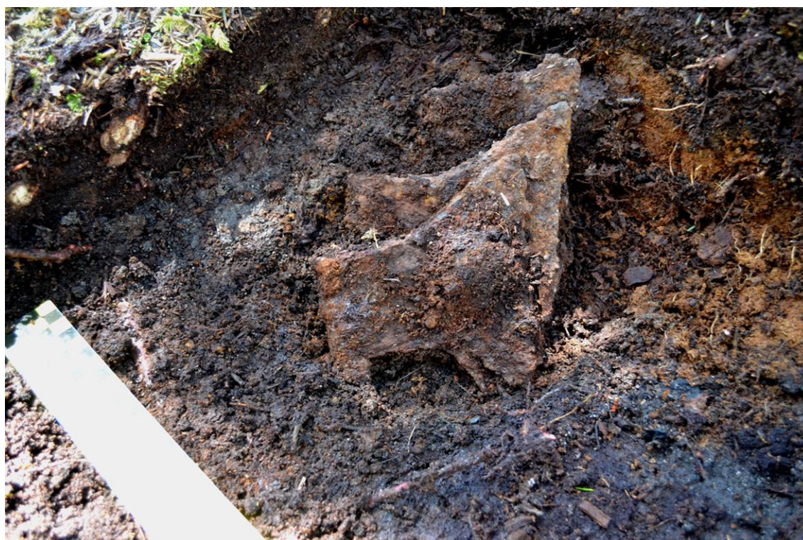
Fig. 1. One of two caches of Russian axes discovered in a test excavation in 2012 at a location believed to be the NEVA survivor camp. This led to a grant application to the National Science Foundation.

several lines of evidence, along with the report of a cannon discovery by a shellfish diver in the 1980s (Wilber 1993:23), suggested a general location of the 1813 wreck of the NEVA. To test the location hypothesis in the field, the team surveyed the beach and forest fringe along a one-km section of shoreline on the lowest tide of the year in June 2012. The only items of interest on the high energy beach were well-rounded pieces of “beach glass” of indeterminate age. On an upland terrace predicted to be the most logical location for a survivor camp, however, a metal detector survey revealed two caches of Russian axes (9 axes total) stacked as if they had been in crates or containers when deposited (Fig. 1). Colonial Russian axes are distinctive due to the barb or “hook” in front of the handle (Viire 1969:15-17). A hearth containing a hand-wrought iron spike and fragments of calcined fauna was also identified, along with multiple metal detector targets that were not excavated. North of this