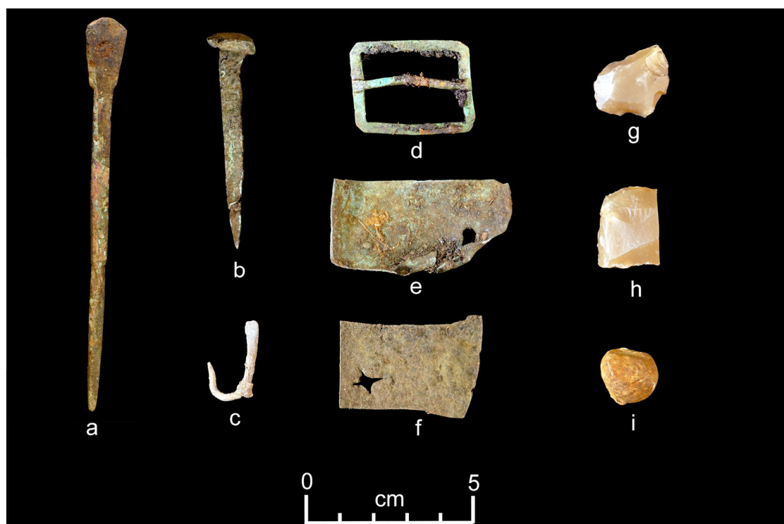
Fig. 6. A representative collection of artifacts discovered in July 2015: a – one leg of a brass nautical divider for measuring distances on charts; b – a copper ship’s nail; c – a fishhook possibly made from a copper nail; d – a brass or copper belt or strap buckle; e – perforated sheet copper, possibly from hull sheathing; f – perforated sheet copper, possibly from hull sheathing; g – French gunflint; h – French gunflint; i – lead musket ball

flints and associated small flakes of gunflint material were recovered, suggesting that they were used as strike-a-lights for fire starting. Micro-flakes from the North Block were associated with burned (carbonized) grass, such as might have been used for tinder. This is consistent with the survivor account that one of the promyshlenniki was able to start a fire with a flintlock pistol, allowing the survivors to make it through the first night (Shalkop 1979:38). Some of the recovered musket balls have been whittled, as if to reduce their size for use in a smaller caliber weapon such as a pistol. Short sections of copper rod were also present, and may have been cut for use in a weapon. Smaller, hand cast lead shot (with mold lines) were also recovered and may sug-