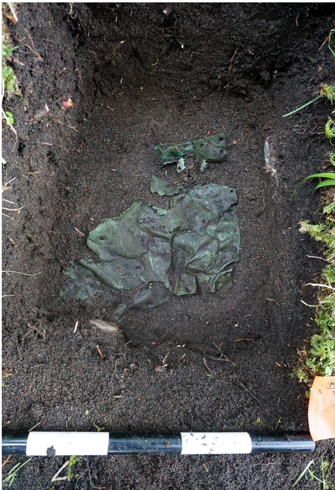
Fig. 8. A cache of copper ship's sheathing discovered in the "North Cove" area in 2016.

Рис. 8. Клад медных оболочек корабля, обнаруженный в районе «Северная бухта» в 2016 г.